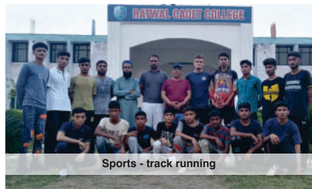
Sports - track running