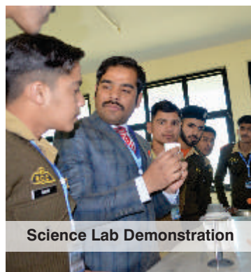
Science Lab Demonstration