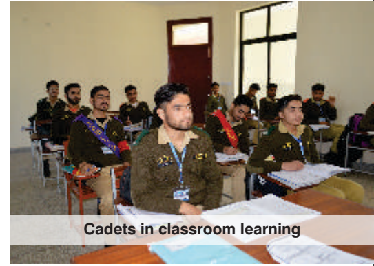
Cadets in classroom learning