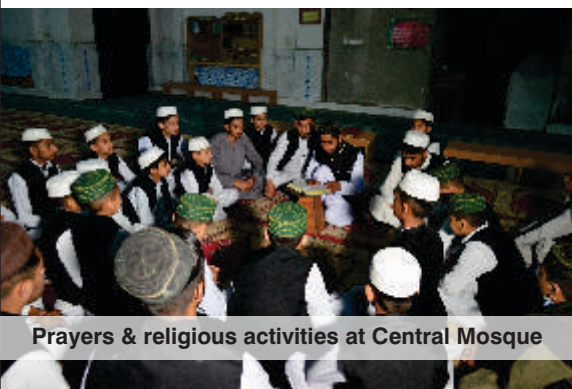
Prayers & religious activities at Central Mosque