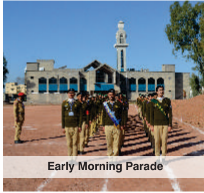
Early Morning Parade