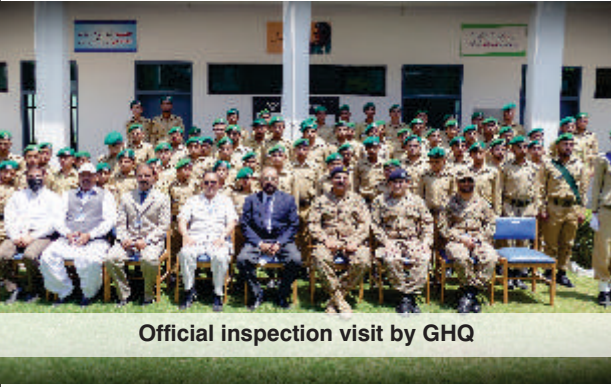
Official inspection visit by GHQ