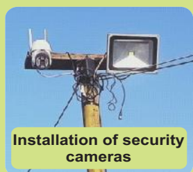
Installation of security cameras