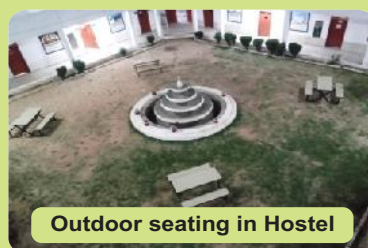
Outdoor seating in Hostel