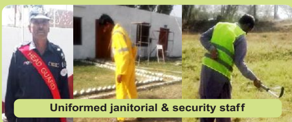
Uniformed janitorial & security staff