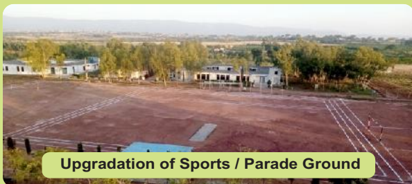
Upgradation of Sports / Parade Ground