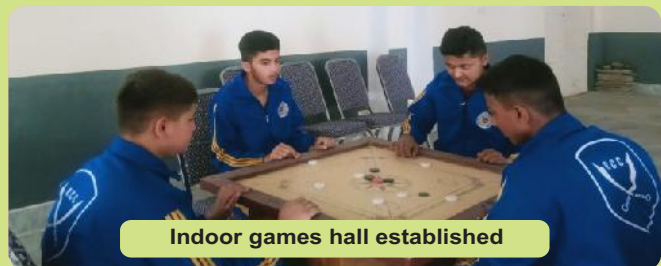
Indoor games hall established