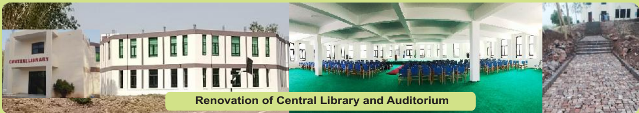
Renovation of Central Library and Auditorium